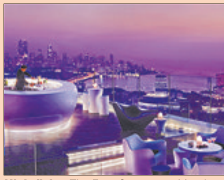
High-flying The Four Seasons in Mumbai

Birmingham Recent years have seen growing numbers of adventurers attempt to cycle round the world but now a British company is to offer the experience as a fully organised and supported holiday The trip departs from London in September 2012 and arrives back nine months later, during which the 30 participants will have cycled more than 18,000 miles through 20 countries. The cyclists will be followed by a truck carrying tents, food, communications and bike repair equipment. A 24-hour headquarters in the UK will manage logistics, flight bookings and visas. As well as the core group of riders, others will be able to join up for sections of between nine and 60 days. The full trip costs £34,000, though a £4,500 discount is being offered to anyone who signs up at this weekend's Cycle Show at the NEC Birmingham, where the organisers are holding a series of talks. www.worldcyclechallenge.com; www.cycleshow.co.uk